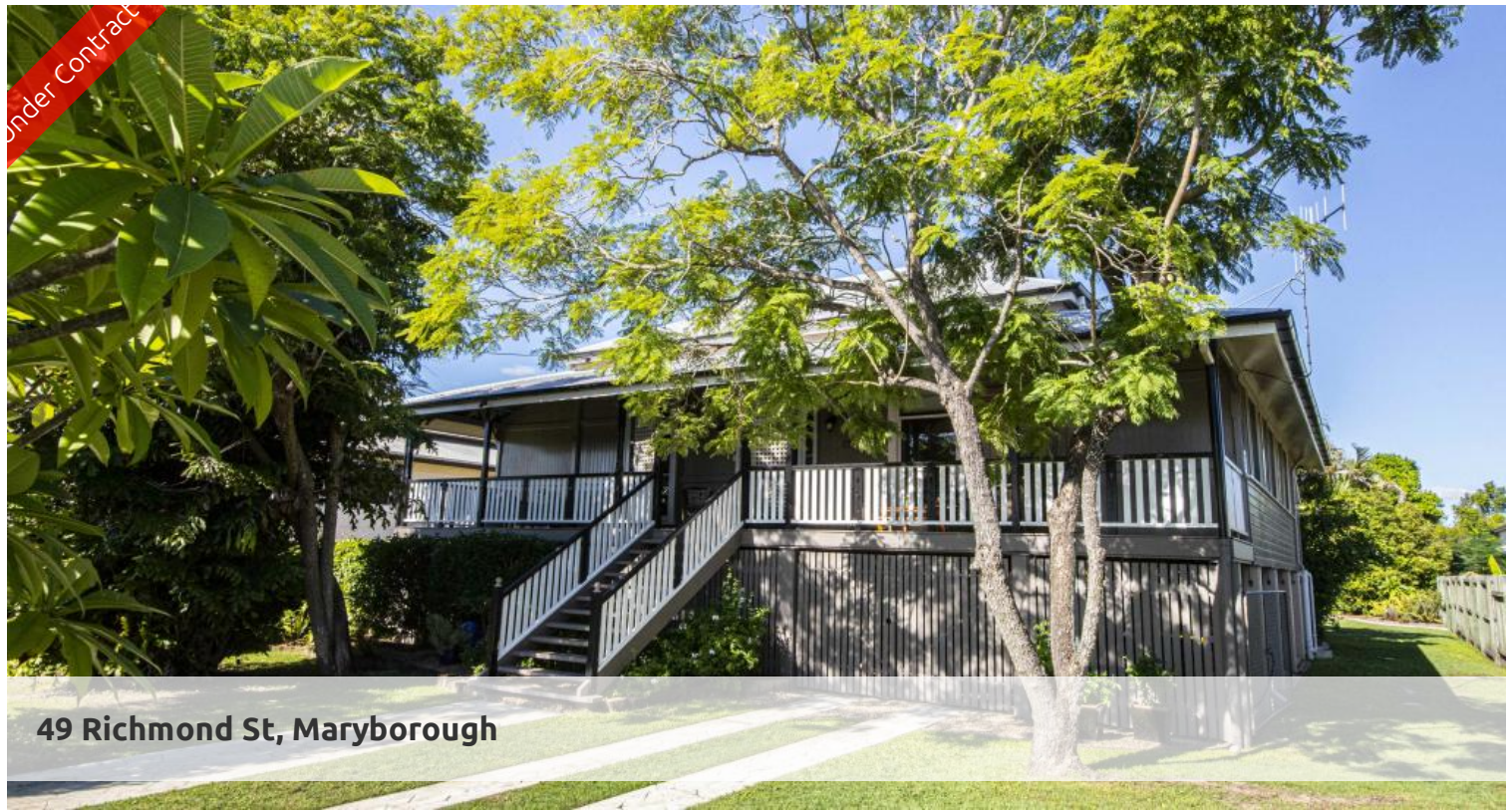
49 Richmond St, Maryborough