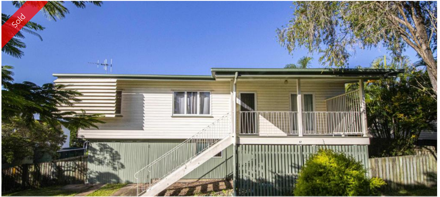
57 George St, Maryborough